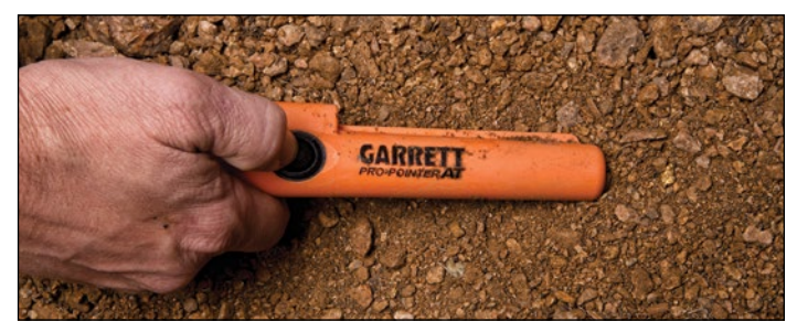
(Above) Fast retune feature quickly tunes out mineralized ground, salt, and other challenging environments.