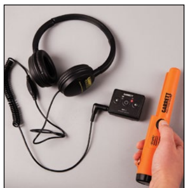
(Above) Simple Pairing to Garrett MS-3 Z-Lynk Wireless Headphones or to any Garrett WR-1 Z-Lynk device. Solid red light on the MS-3 Wireless Headphones or WR-1 Z-Lynk receiver indicates proper pairing with the pinpointer.

The Garrett Pro-Pointer AT Z-Lynk is manufactured in the United States of America and in accordance with Garrett's ISO 9001 internationally certified Quality Management System and meets the following international standards: